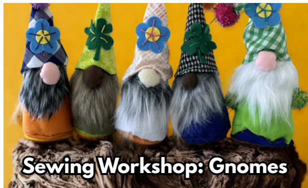
Sewing Workshop: Gnomes