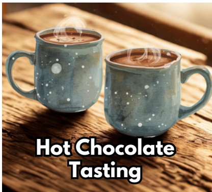
Hot Chocolate Tasting