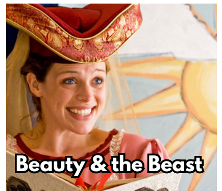
Beauty & the Beast

Registration is required and programs are held in-person unless otherwise noted in the event description. For questions or more information, visit the Events page of our website at www.summitlibrary.org or call the Information Desk at 908-273-0350, option 3.