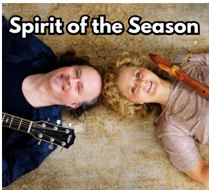
Spirit of the Season