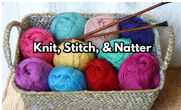
Knit, Stitch, & Natter