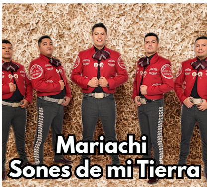
Mariachi Sones de mi Tierra