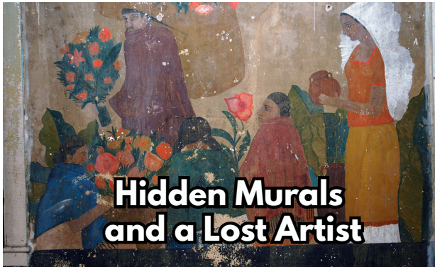
Hidden Murals and a Lost Artist