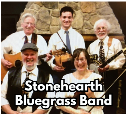
Stonehearth Bluegrass Band